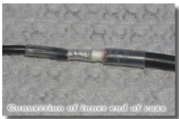
Photo B – Connection of inner end of coax section (closer to center). Note that only the center conductor is connected to the wire.