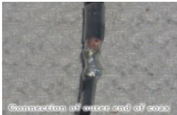
Photo C – Connection of outer end of coax section (further from center). Note that both center conductor and shield are connected to the wire.