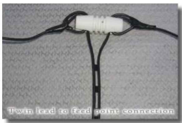
Photo D – Connection of twin lead to inner antenna wires at center of antenna