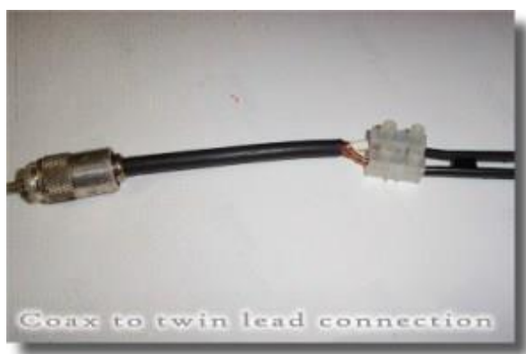
Photo E – Connection of twin lead to coax. Short length of coax section is for illustration purposes only. All connections should be weatherproofed with shrink-tubing, CoaxSeal, or similar.