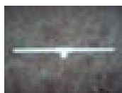
The PVC Cross Bar

The PVC cross bar is very easy to make. Two 8.375" lengths of 3/4" PVC are inserted into the 3/4" PVC tee. As a double-check that the lengths are correct, and that your PVC parts are the same as mine, temporarily attach the two PVC reducing tees to the ends, as they appear in the picture of the assembled main loop . The centers of the reducing tees (and thus the centers of the copper pipes which will later pass through them) should be exactly 21" apart.