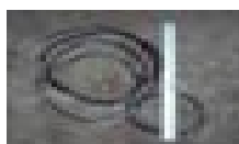
The PVC Vertical Support

The PVC cross bar is very easy to make. Two 8.375" lengths of 3/4" PVC are inserted into the 3/4" PVC tee. As a double-check that the lengths are correct, and that your PVC parts are the same as mine, temporarily attach the two PVC reducing tees to the ends, as they appear in the picture of the assembled main loop . The centers of the reducing tees (and thus the centers of the copper pipes which will later pass through them) should be exactly 21" apart.