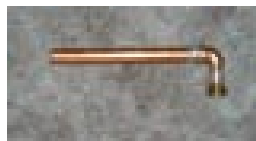
The Rotor Contact Assembly

The rotor is easy! It's just a 9 inch piece of 3/4" copper repair coupling, lovingly deburred so it can slide easily over the rotor contact and the dielectric sleeve.