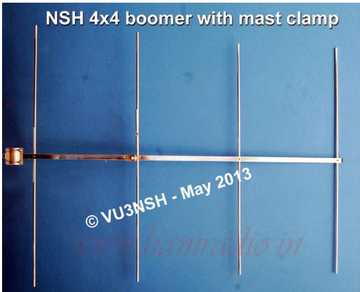
Fig. 1. NSH 4 x 4 boomer with mast clamp

It is a high gain simple beam antenna for 2 meter frequency. It is just a 4 element on 4 feet boom with a gain of 8 dB and having a low SWR of 1.2 : 1 on the operating frequency 144 to 146 MHz. NSH 4x4 Boomer was simulated due to the need of a beam antenna with minimum elements, minimum boom length and maximum forward gain. Moreover the SWR must be within the limit. The homebrew cost also should be low. This antenna is very easy to carry anywhere for portable operations like disaster management, field day etc. Due to 4 feet boom it can be mounted within the restricted spaces.