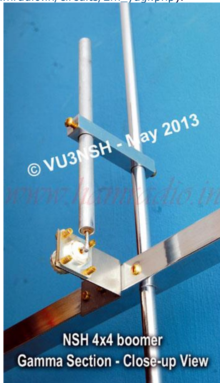
Fig. 2. Gamma section - Close-up view

Gamma section needs protection from moisture, rain water etc. After tuning with the SWR meter, wrap teflon tape on total gamma section to prevent from WX problems. Remember that the gamma tube should be upward and the coaxial cable from gamma section parallel with boom and take it down after the reflector like NSH 7 element beam (Refer the link www.hamradio.in/circuits/2m_yagi.php ).